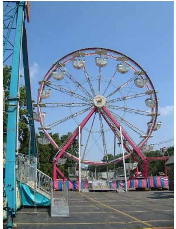
The Giant Ferris Wheel