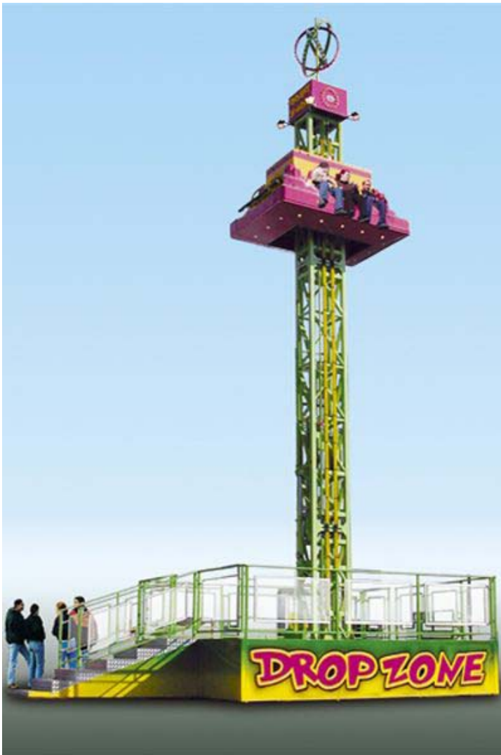
The Drop Zone

Just wanted to give a heads up about our ride vendor, Carol Stream Amusements. They will not be bringing the Roller Coaster ride with this year. They are going to bring the Giant Ferris Wheel and the Drop Zone in it's place. See the pictures below and on our web site, www.hiltonfd.org . Follow the carnival links.