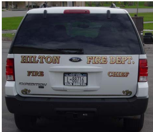
New Chief's Vehicle