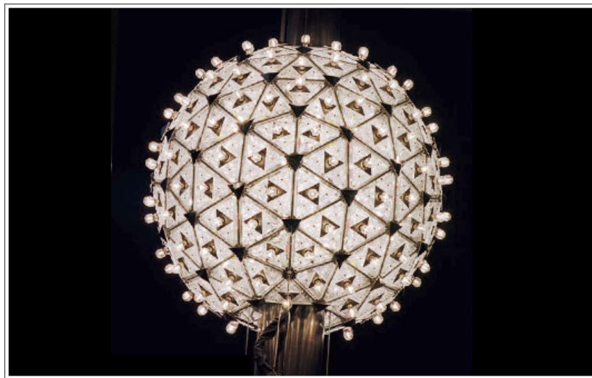
New Year's Eve Ball In Times Square